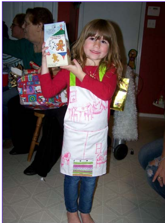
One VERY happy little girl wearing her brand new apron!

Finally, pin your pocket to the center of the lower portion of the apron and sew it to the apron on the left, right and bottom.